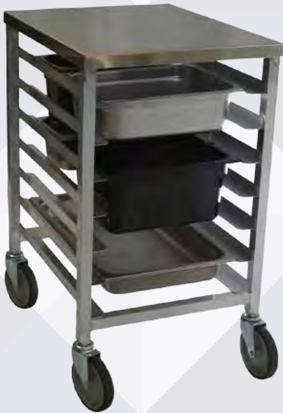
WE3020W-7-SP-ST (shown with optional stainless top)